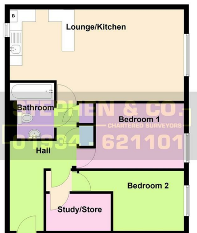
Total area: approx. 63.4 sq. metres (682.9 sq. feet)

Floor plans are for illustrative purposes only and are not to scale. Whilst every effort is made to ensure they are as accurate as possible interested parties must satisfy themselves by inspection or otherwise of their accuracy. Plan produced using PlanUp.